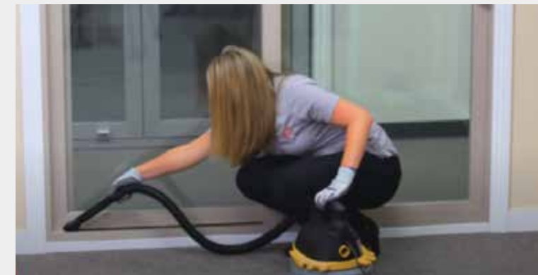
HOW TO: CLEAN AND LUBRICATE A SLIDING DOOR TRACK