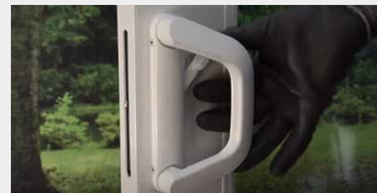
HOW TO: ADJUST A SLIDING DOOR LOCK AND HANDLE