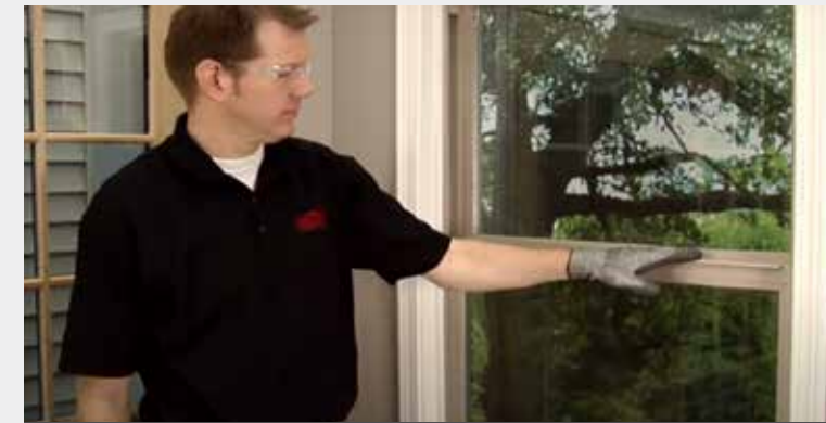
HOW TO: REPLACE AND RESET A SINGLE HUNG BALANCER