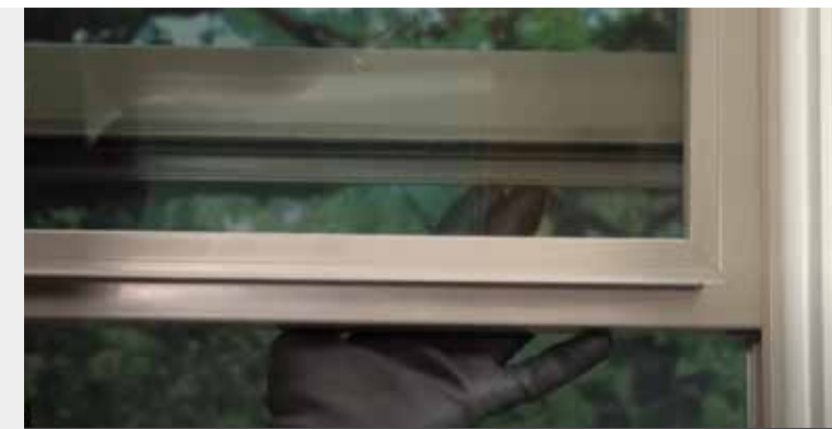
HOW TO: REMOVE AND REPLACE A WINDOW SCREEN